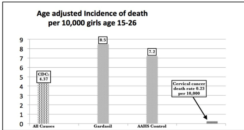
Background CDC rate 4.37 source: National Vital Statistics Report Vol. 53 2002 page 24. 37 Gardasil rate 8.5: 10/11,778. AAHS control rate 7.2: 7/9,680 38 Cervical cancer mortality: 2.3 per 100,000 source: National Cancer Institute SEER Cancer Statistics Review 2015 39

294. When Merck added in deaths from belated clinical trials, the death rate jumped to 13.3 per 10,000 (21 deaths out of 15,706).