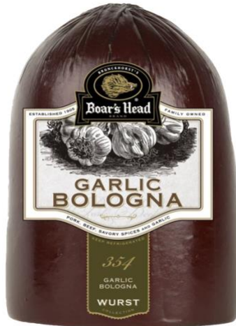
Boar's Head Garlic Bologna