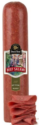
Boar's Head Beef Salami