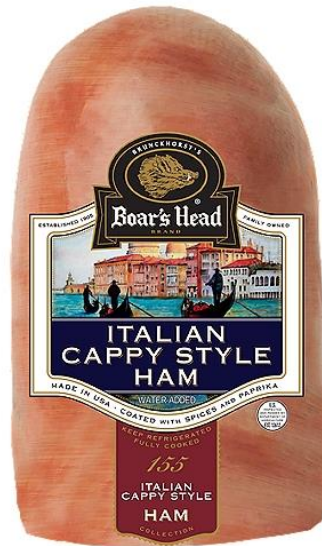
Boar's Head Italian Cappy Style Ham