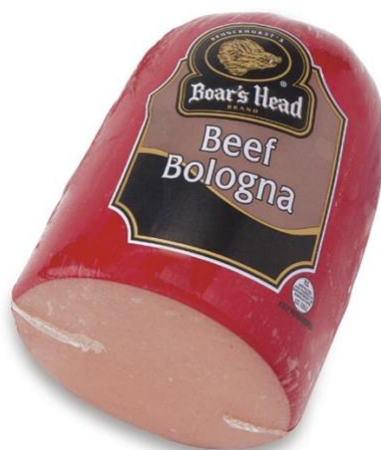
Boar's Head Beef Bologna