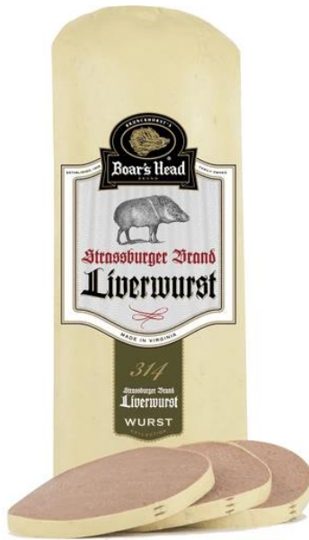
Boar's Head Strassburger Brand Liverwurst

19. In more detail, some of these Products are deli meats, as seen below: