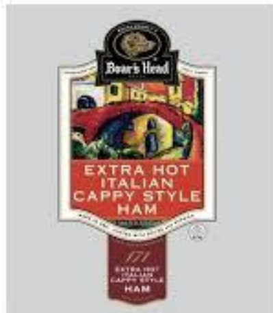
Boar's Head Extra Hot Italian Cappy Style Ham