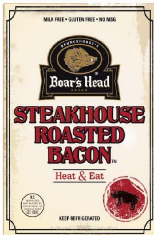
Boar's Head Steakhouse Roasted Bacon Heat and Eat