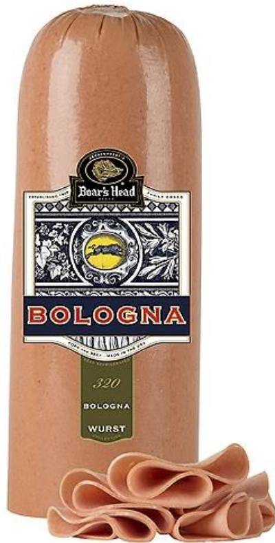
Boar's Head Bologna